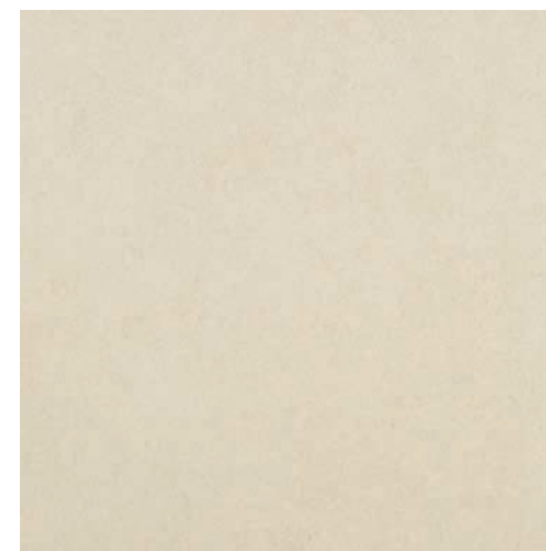
Beige 45x45 - 18"x18"