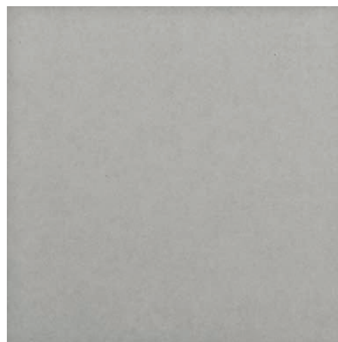
Gris 45x45 - 18"x18"