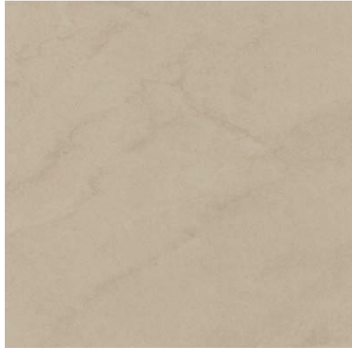
ONICE 50x50 - 20"x20"