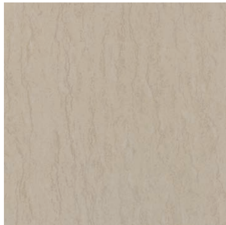
Travertino Cat. F2 40x40 - 16"x16"