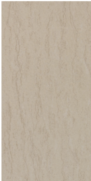
Travertino Cat. F5 30x60 - 12"x24"