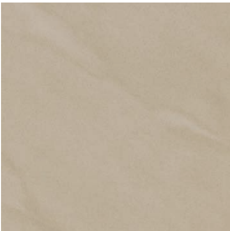
PAOLA 40x40 - 16"x16"