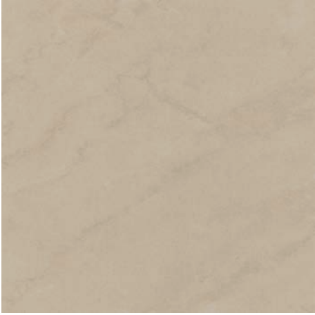
ONICE 40x40 - 16"x16"