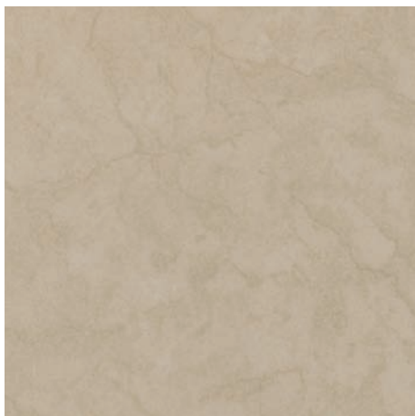
SILVIA CAT. F2 40x40 - 16"x16"